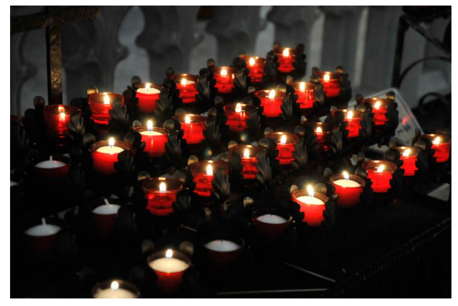
Law Of Attraction: The Power Of Prayer

There are a lot of different ways to view the process of turning our ideas into realities, or experiencing them in the tangible world; but they all involve thinking of what you wish.